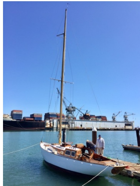
Launched and taking up - she was leaking but gradually with strong bilge pumps she took up and leaking subsided. Dan and Sue in pic