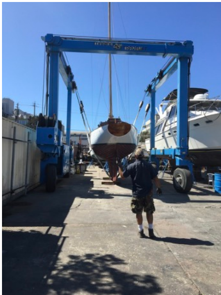
Ready for launch