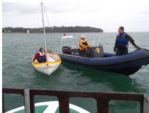
Me on the helm rescuing one of our members who had to retire a race due to rig failure

I am now 'not so' settled back into my life here after a busy period in Europe, most of the time spent at my little home and sailing club on the Isle of Wight. It has been busy at the Brading Haven Yacht Club with summer races virtually every day plus a very good cadet sail training program with record numbers of new recruits to sailing signing up. We also put on some great summer events, including disco nights, the annual summer ball, and contests for home made model boat races for the kids. So, I was busy, entering races (and winning the Swan championship), as well as helping one of our safety RIB's (Rigid inflatable Boat) out on our races.