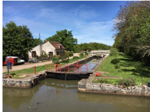
One of the locks