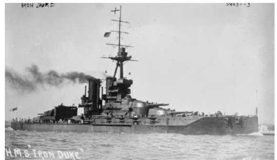
The Battleship HMS Iron Duke, the flagship of the Grand Fleet

Note: A word on the difference between a Battleship and a Battlecruiser. The Battleship was a heavily armored ship with 12 inch (pre-dreadnought) to 15 inch guns with a top speed of around 20 knots; their purpose was to engage the enemy at great distance and slug it out with corresponding enemy battleships, the armor providing extreme protection against enemy shell fire. The Battlecruiser was designed to be Battleship size but carried less armor to allow for higher speeds of up to 30 knots. These ships sported either 13 inch or 15 inch guns and the purpose was to engage and retreat at high speed and also provide scouting services for the main Battleship fleet.