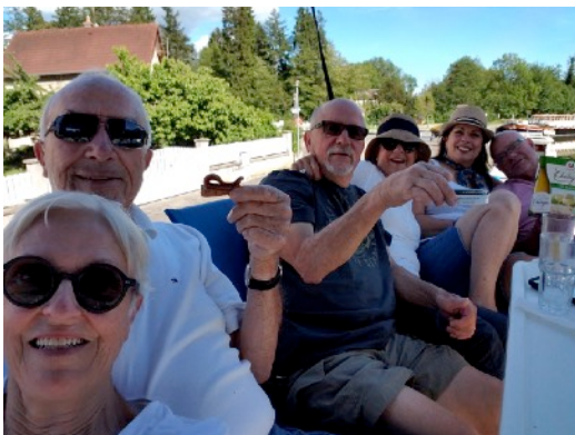
Piss artists at work - upholding the traditions of the SPYC