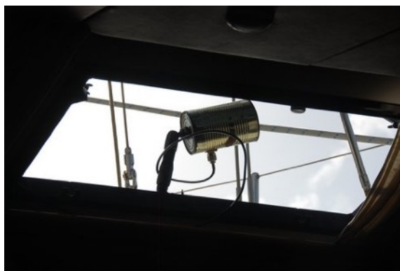
A homemade inexpensive Cantenna made out of a tin can. That can amplify WiFi signals from -5 to 22db