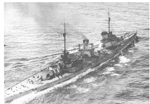
The German Battlecruiser SMS Seydlitz

The German High Seas fleet was no less impressive at the start of WW1 and almost matched the English Grand Fleet. The fleet