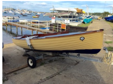
Frolic the Swan

My apologies for the late may edition...I am on my travels again and currently in my house on the Isle of Wight getting my classic wooden sailing boat 'Frolic' prepared for launch next week. I bought her from a friend two years ago. She is the first Swan class 16 foot clinker mahogany wood built boat in 1955 for our sailing club in Bembridge - The Brading Haven Yacht Club in Bembridge; I have twinned the club with our Club in Brisbane and so any of our members are very welcome to come to the club and enjoy the facilities if visiting the UK.