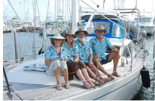
A relaxed crew