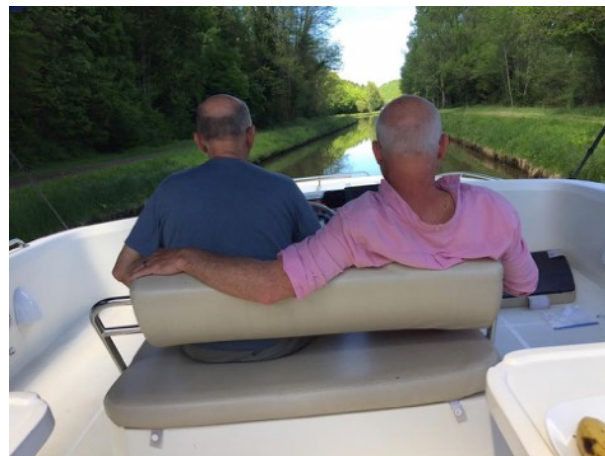
I worry about these two