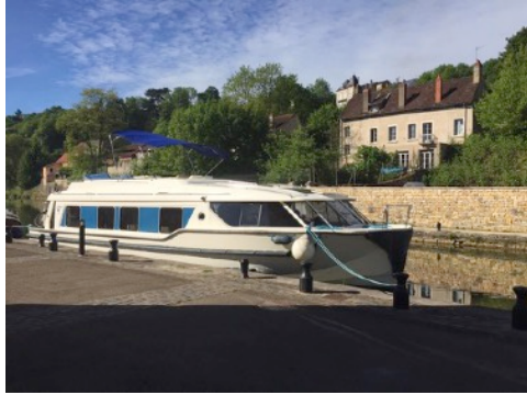
The Mobile Digs