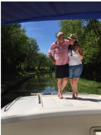
The Love Boat Couple