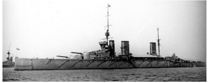
The Battle Cruiser HMS Lion

submarines were also operational. Most of the Grand fleet was stationed at Scapa Flow in the Orkneys - A chain of Islands north of Scotland with a natural harbor, and the fleet was