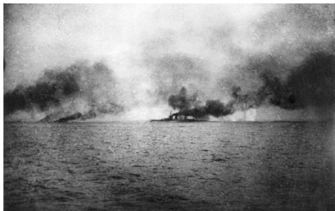
The run to the South. HMS Lion to the right has just suffered a major hit and explosion on her mid 15inch gun turret, killing over 90 crew - the ship survived. To the left is the smoke remains of HMS Queen Mary that blew up and sank within seconds, killing over 1000 crew

Try to imagine a warship of this size in full action with over 1,000 men at their battle stations - engine room, guns, navigation, etc, and then an enemy shell explodes in the ship's internals, spreads to the magazines and blows up the entire ship, obliterating over 1,000 crew in just a few seconds. It shows the